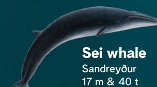
Sei whale Sandreyður 17 m & 40 t

You might also see these magnificent creatures: