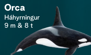
Orca Háhyrningur 9 m & 8 t